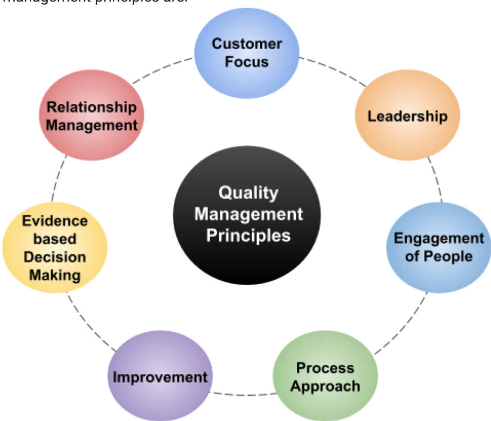
7 key principles of quality management